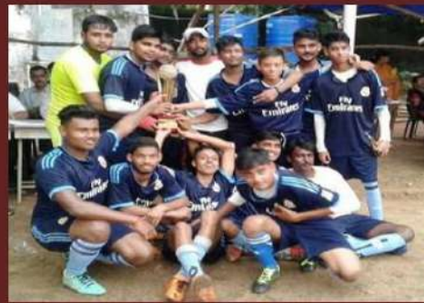
MARK BUNTAIN INTER SCHOOL FOOTBALL TROPHY CHAMPION